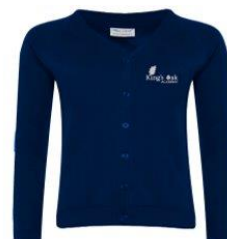
Classic Cardigan Lower & Middle School

Junior Price: £8.50 Senior Price: £10.95