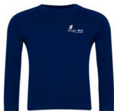
Classic Sweatshirt All Phases

Junior Price: £10.50 Senior Price: £14.95