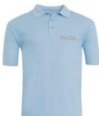
Classic Polo Middle School

Junior Price: £10.50 Senior Price: £14.95