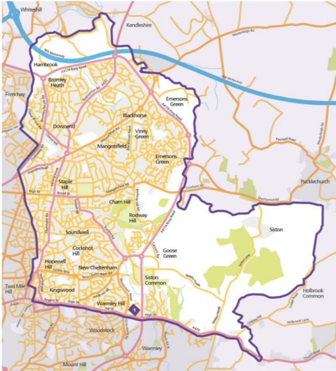
1 – King's Oak Academy