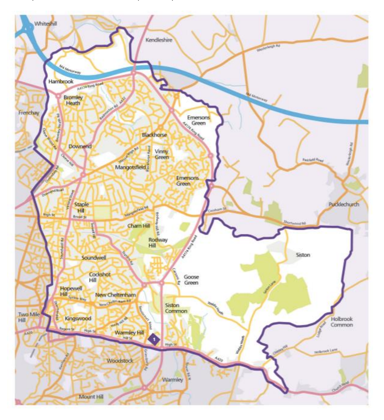
1 – King's Oak Academy