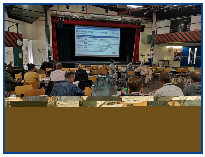
Year 11 working hard in Religious Studies.