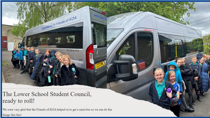
The Lower School Student Council, ready to roll!

We were very glad that the Friends of KOA helped us to get a mini-bus so we can do fun things like this!